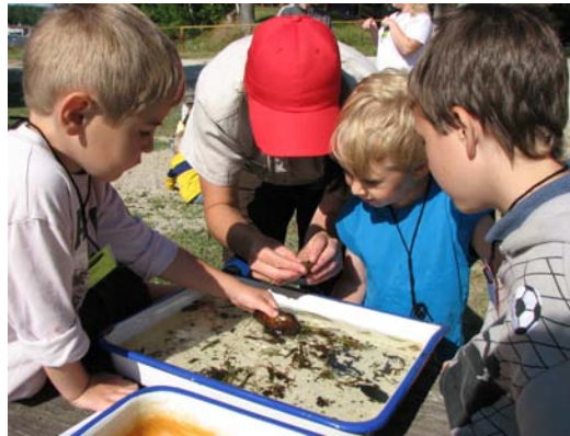
Young students work with a Seney Wildlife Refuge Biologist exploring aquatic fauna found in South Manistique Lake, Summer 2008