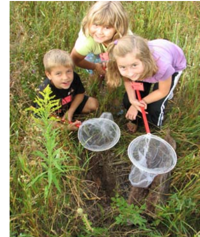
Students collecting invertebrate species in a field. Curtis, Michigan, Summer 2008.