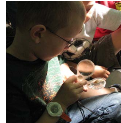
Student exploring in a hands-on environment.